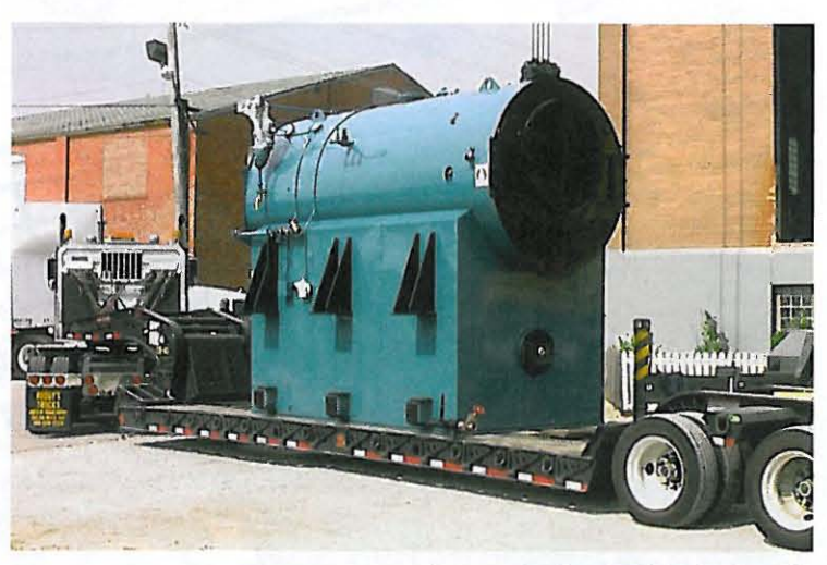
Biomass boiler used by Indiana's Putnamville DOC facility that burns bio-products such as switch grass, bark, sawdust and wood chips.

From use of biomass boilers to lower heating bills to collecting AC condensation to conserve water, here are some sustainable steps employed by forward-thinking corrections agencies.