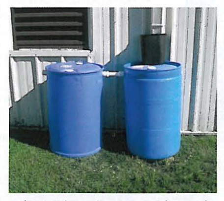
Reharvesting rainwater can be used to flush toilets, do laundry or water gardens.

Facilities can also save money by reducing material costs because they use smaller diameter piping and do not require vent stacks. They can be installed vertically or horizontally and therefore offer flexibility in designing or renovating facilities. The Salinas Valley State Prison (SVSP)